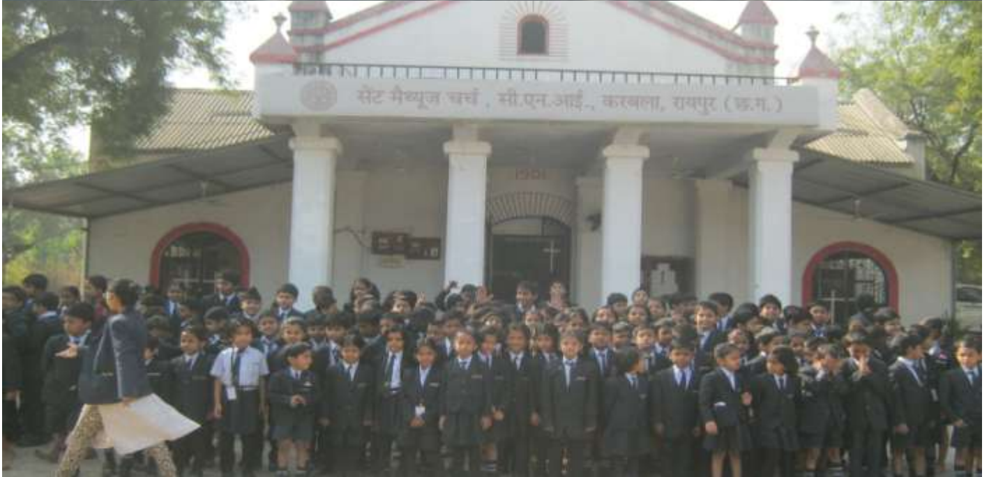
3) Maths Olympiad conducted on 10 th Dec,2015, 63 students participated from class 1 to class 5.